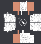
LEVEL 10-12, 15-29